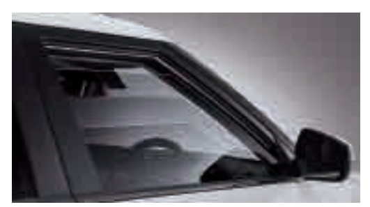
Safety power window on driver's side