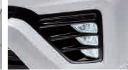
LED fog lamps