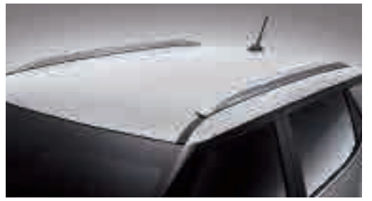
Fashionable silver roof rails