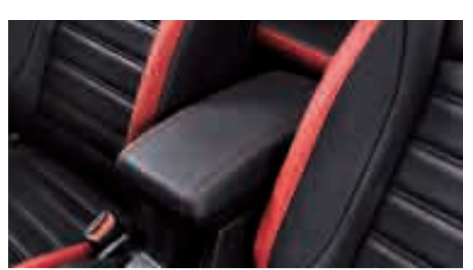
New centre armrest with storage