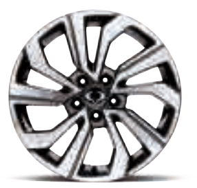
18"diamond cut wheels with 215/50R tyres