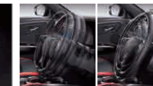
Telescopic & tilt-adjustable steering column