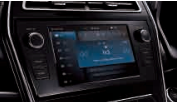
8^{\prime\prime} smart audio system with rear view camera display and Bluetooth smartphone link.