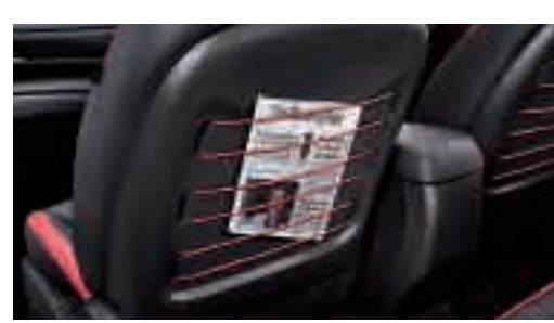
Backrest looped bungee cord