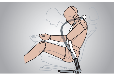
Safety belt dual pretensioner Pre-tensioning mechanism greatly reduces the risk of serious injury.

Disc Brakes Amply-sized front / rear discs have ventilation added to the front for maximum stopping power.