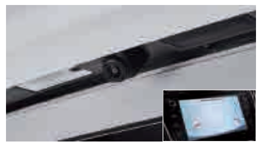
Rearview camera and monitor