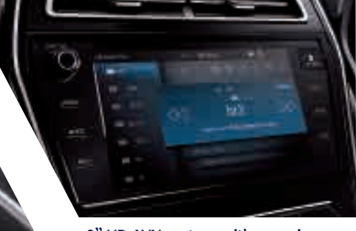
9" HD AVN system with rear view camera display and Bluetooth smartphone link. (EU region only)

Cluster navigation screen Full navigation AV mirroring Turn-by-turn