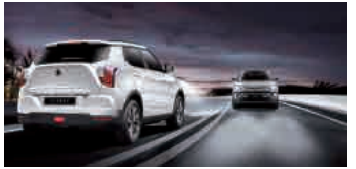
High Beam Assist (HBA)

By monitoring the headlights of oncoming vehicles and the rear combination lamps of the vehicles ahead, HBA analyzes ambient light levels to automatically switch between high and low beams.