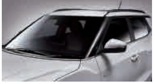
Chrome moulding along the beltline and bonnet