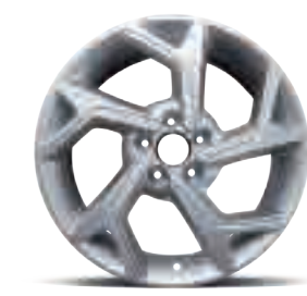
18" alloy wheels with 215/50R tyres