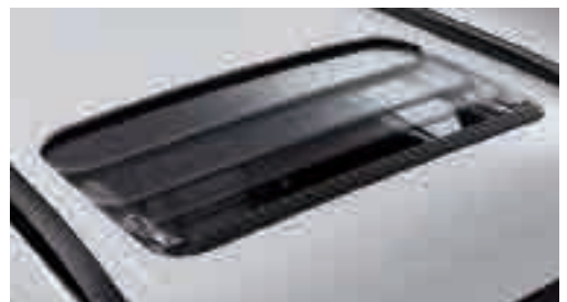
Safety power sunroof