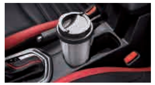
Centre console with dual cup holders