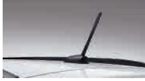
Roof-mounted pole antenna