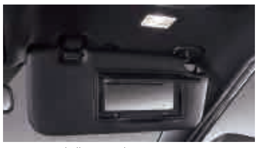
Sunvisors with illuminated vanity mirror