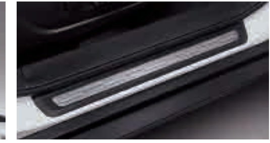
Stainless steel front door scuffs