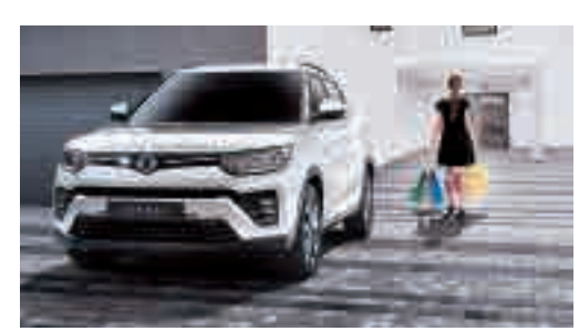
Automatic door locking system