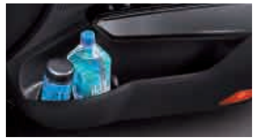
Large capacity door map pockets