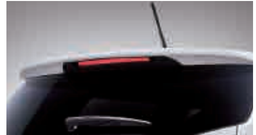
Aerodynamic rear spoiler