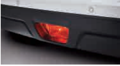
Rear fog lamp