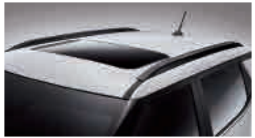
Sporty black roof rails