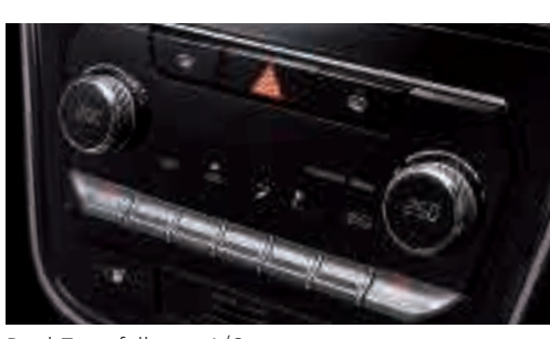
Dual-Zone full auto A/C