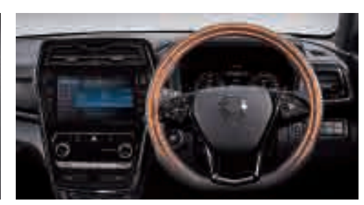
Heated steering wheel