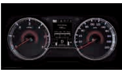
Standard instrument cluster