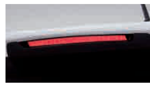
High mounted LED stop lamp