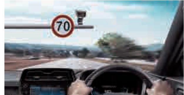
Traffic Sign Recognition (TSR) : EU only Shows traffic information, including speed limits, maximizing driving safety.

While stopped and the car in front has started to move, FVSA will issue a visual pop-up alert and audible alarm.