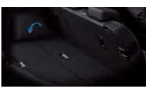
Cargo space divider/Standard