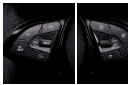
Hands-free audio switch / Cruise control switch