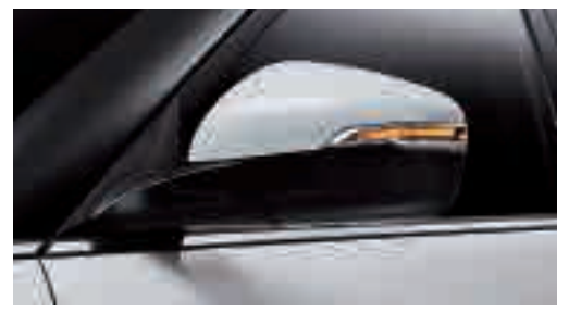
LED repeaters on exterior mirrors