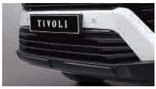
High-gloss intake grille