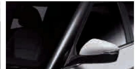
Glossy black garnish on A-Pillar