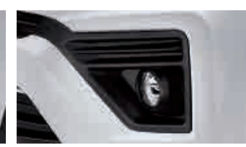
Bulb-type fog lamps